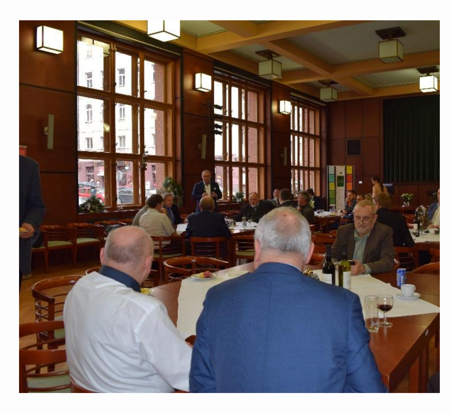
December 5, 2017 - Christmas meeting of representatives of research organizations and CAAS