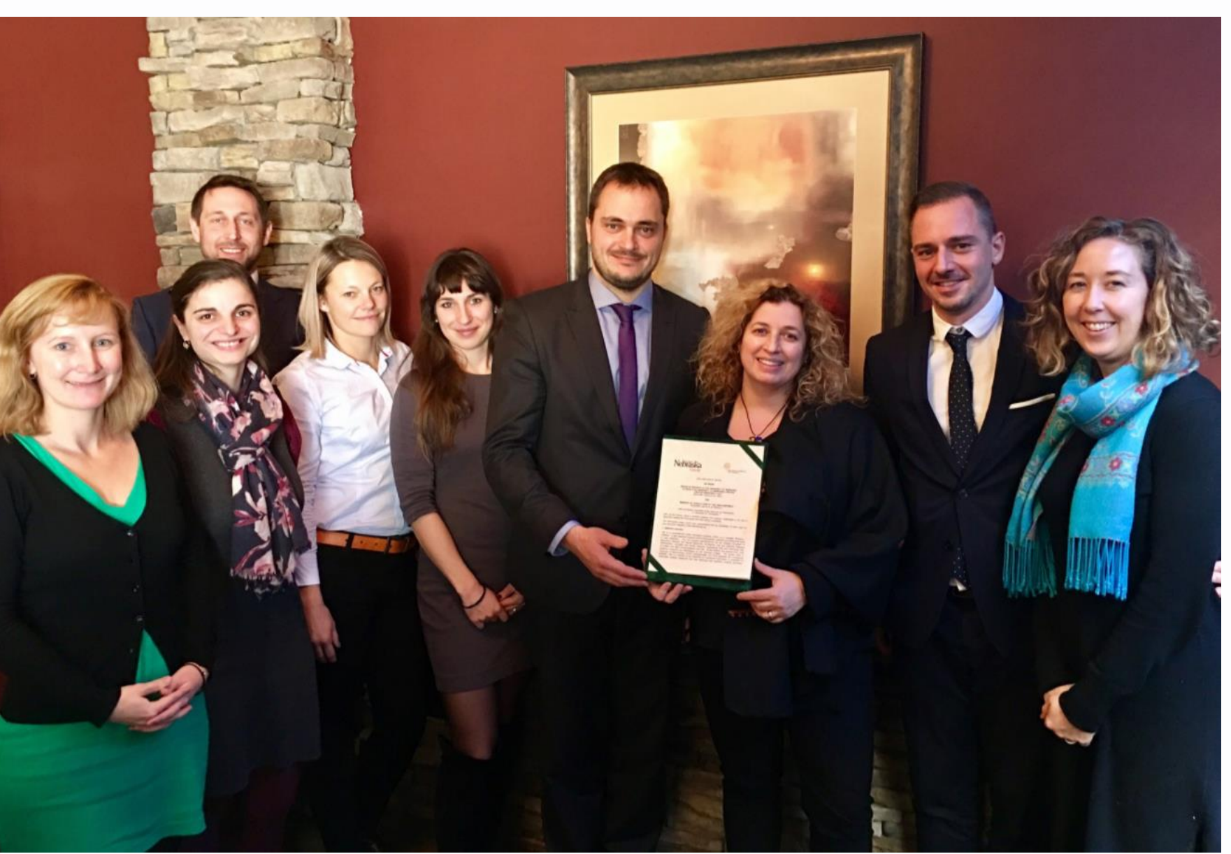
November 22, 2017 - An important step towards cooperation between the Ministry of Agriculture of the Czech Republic and the University of Nebraska in the field of science and research