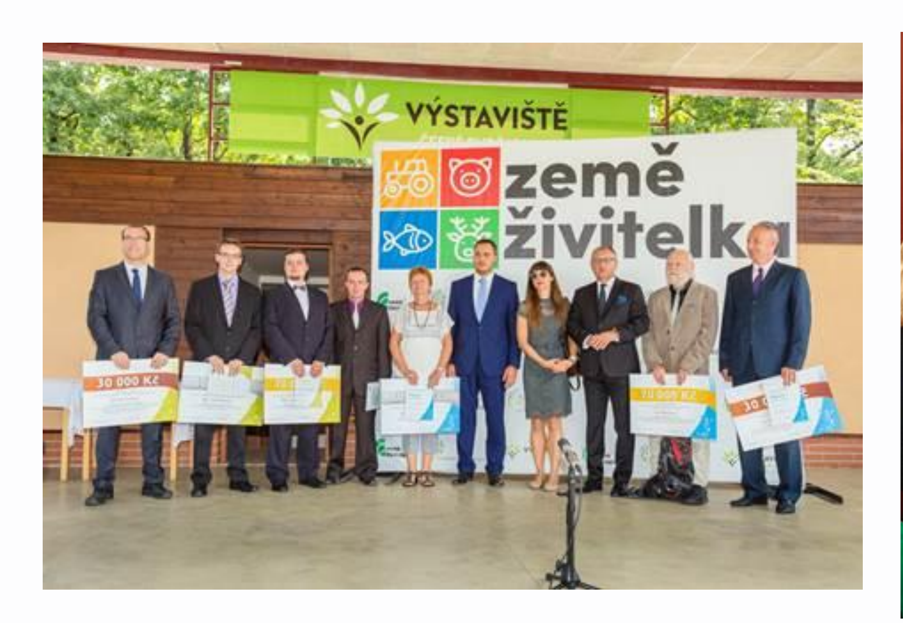
August 24, 2017 - The Minister's Awards ceremony in České Budějovice