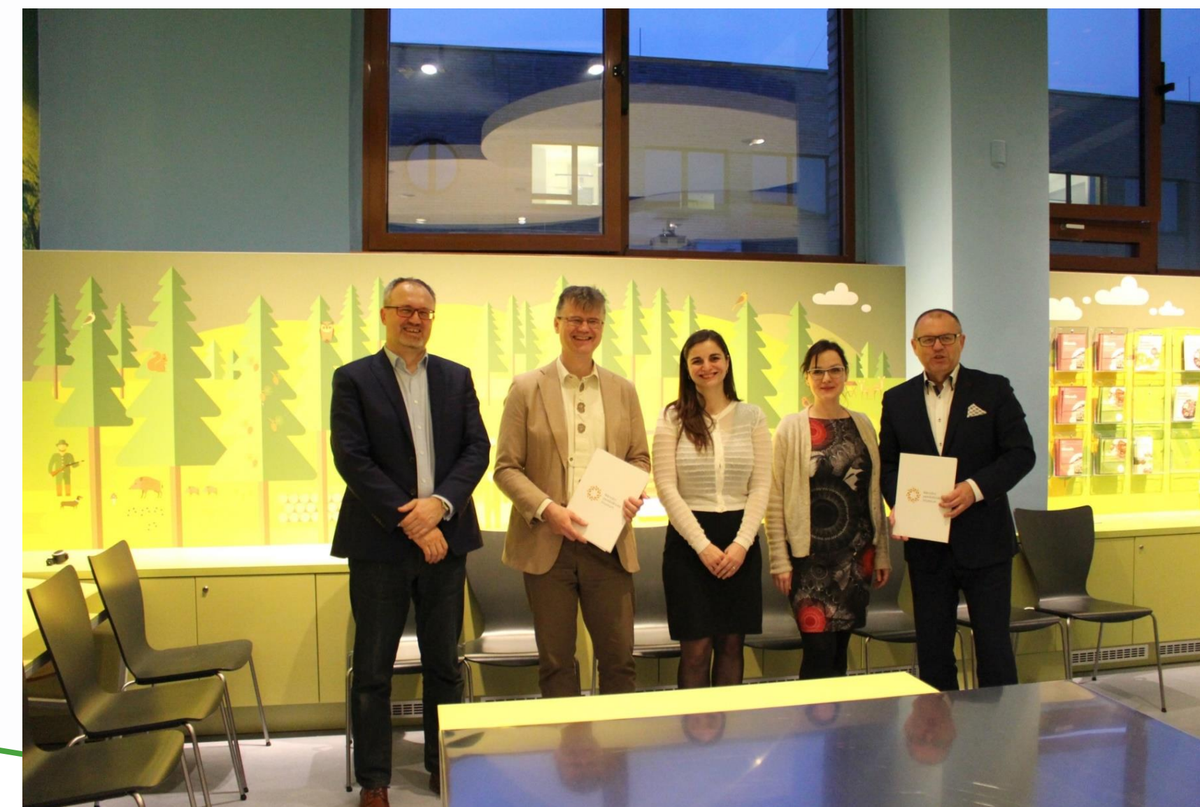
January 9, 2018 Memorandum of partnership and cooperation was signed between CAAS and NMA